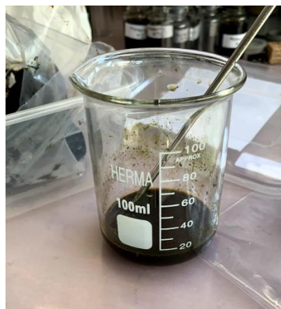
Pict 1 : Simplicia Dilution Process